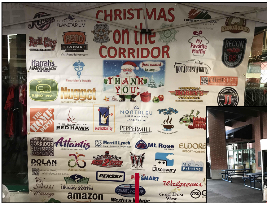
There we are