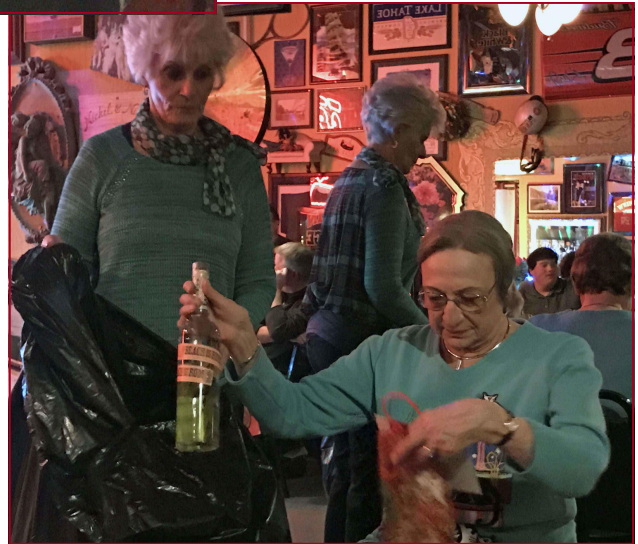
On second thought, I think I’ll just toss it.