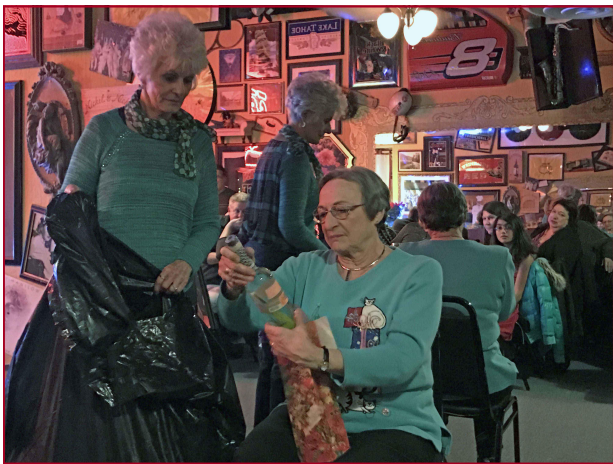
Hmm, that’s nice.